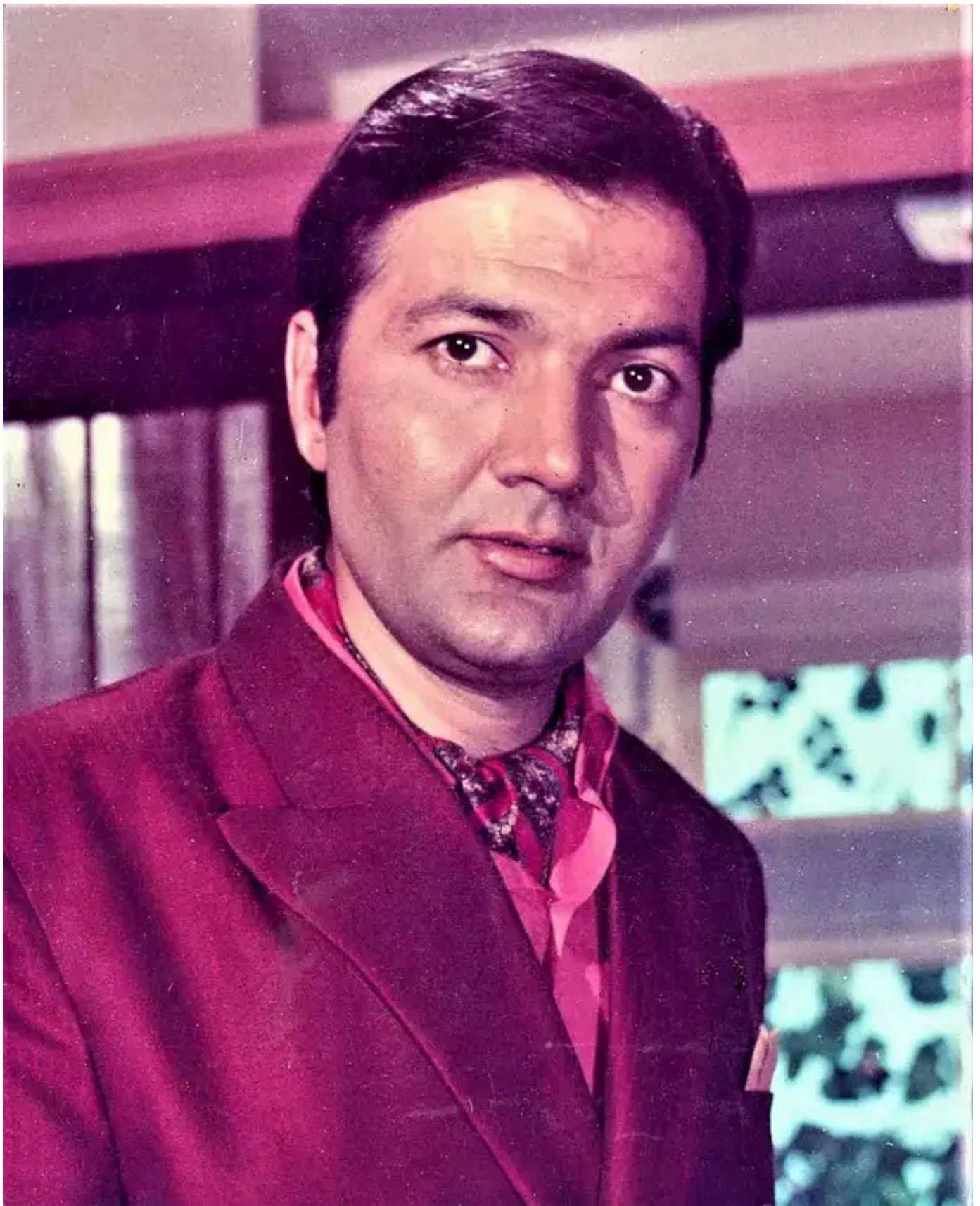
Prem Chopra's still from a movie

According to PTI, the doctor further explained, "He is 92 years old and has some age-related issues, which is why his recovery is taking a bit longer. He is expected to be fine within the next three to four days and will likely be discharged soon."