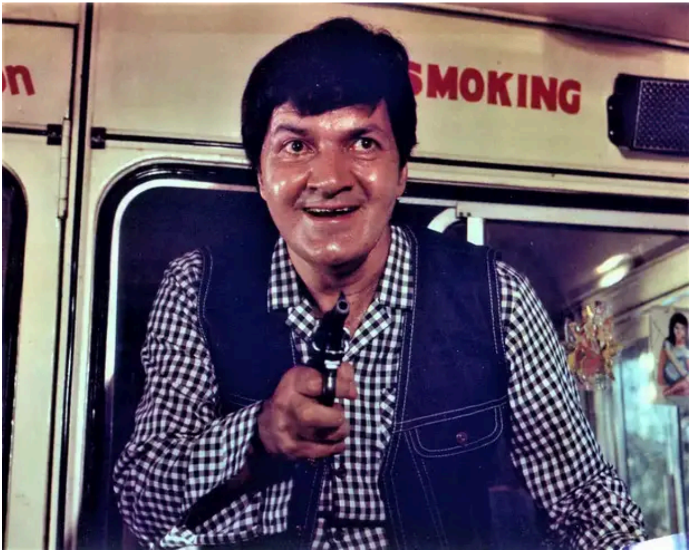
Prem Chopra's scene from a film

Known for his professionalism and enduring charm, Chopra continued to reinvent himself with changing times. In 2023, he appeared in Sandeep Reddy Vanga's blockbuster Animal , alongside Ranbir Kapoor, Rashmika Mandanna, Anil Kapoor, Bobby Deol, Triptii Dimri, Suresh Oberoi, and Shakti Kapoor. Portraying Ranbir Kapoor's granduncle, he once again proved his timeless appeal and lasting contribution to Indian cinema.