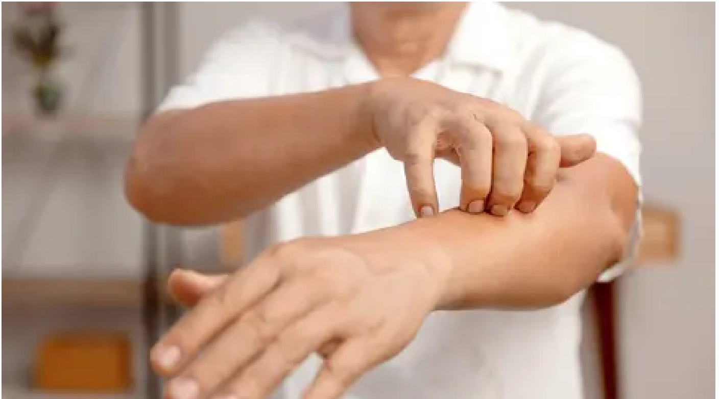
One ailment caused by exposure to sewage is contact dermatitis, where the skin becomes red, itchy, and inflamed due to irritants or allergens.