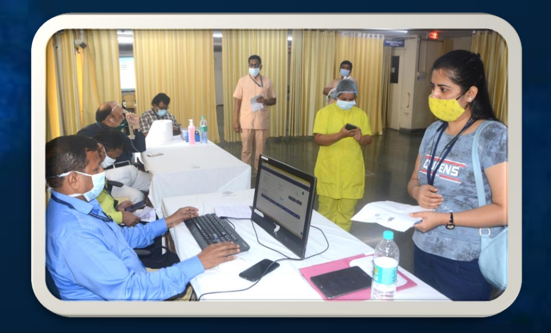
Photo ID is a must for both registration and verification of beneficiary at session site to ensure that the intended person is vaccinated.